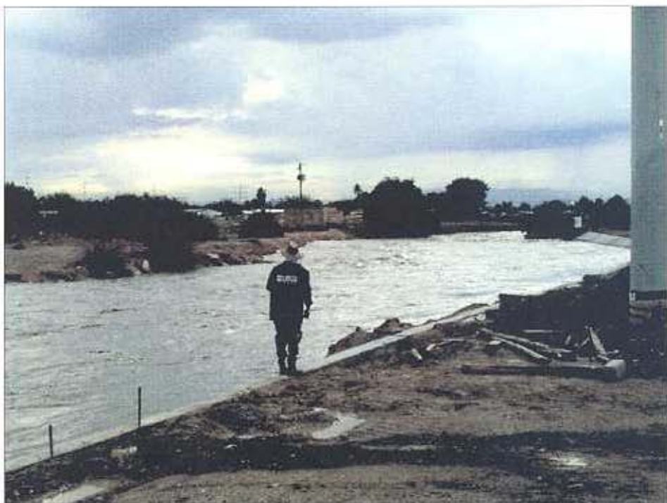
Figure 2. View upstream of flow at peak discharge (6,100 \text{ft}^3/\text{s} ) in Las Vegas Wash below Flamingo Wash confluence (site 18, Fig. 1 and table on facing page) during September 11, 1998, storm.