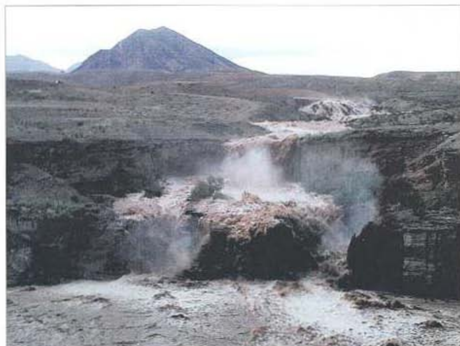
Figure 4. Floodwaters released from one of three overflow spillways at Lake Las Vegas during flood of September 11, 1998, into Las Vegas Wash (below site 24; see Fig. 1 and table). Flow was estimated to be 6,000 ft 3 /s at time photograph was taken.

For more information on the U.S. Geological Survey studies described in this Fact Sheet, or on other aspects of water resources in Nevada, please contact: